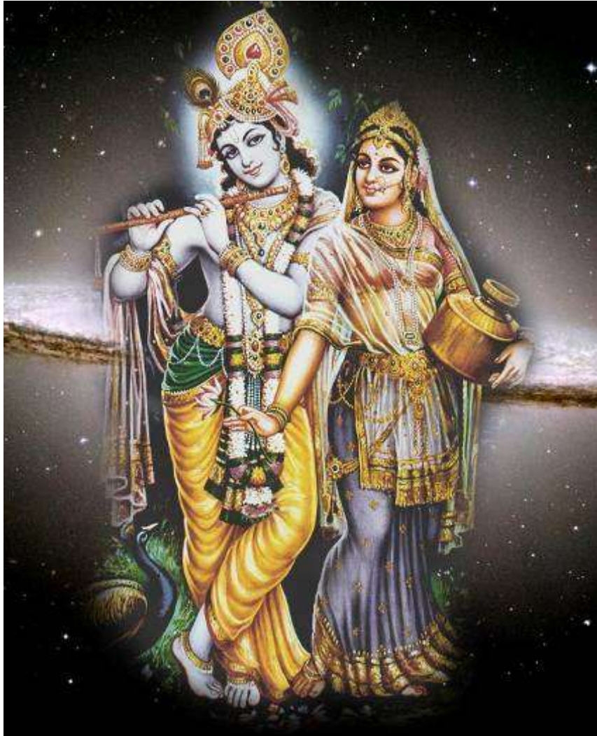
Radha & Krishna