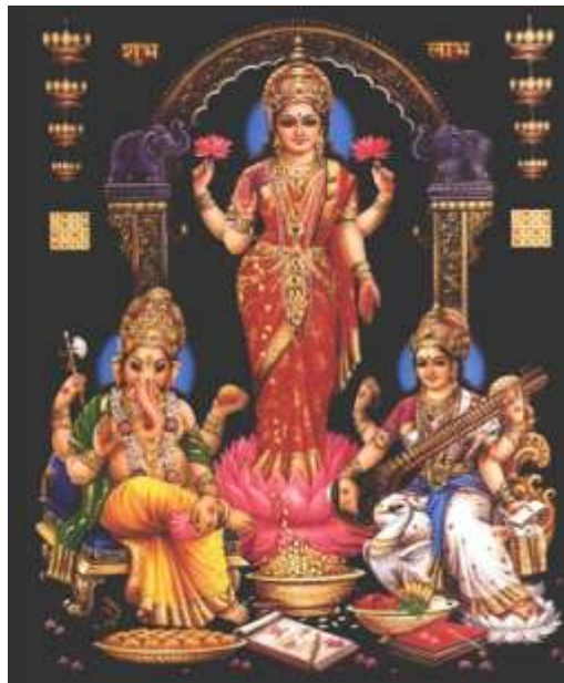
A Rare Painting of Mother Lakshmi with Lord Ganesha and Mother Saraswati